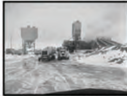
Sunroc Cement Batch Plant

Proposed with 3 cement silos and a fly ash silo sending unhealthy particulates in the air, dust throughout neighborhoods, health impact for up to 5 miles, chemical runoff near Mason Creek, and constant truck traffic hauling cement and chemicals.