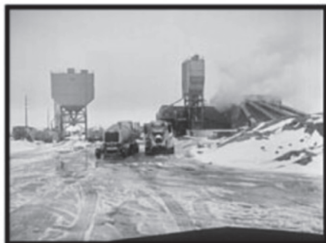
Sunroc Cement Batch Plant

Proposed with 3 cement silos and a fly ash silo sending unhealthy particulates in the air, dust throughout neighborhoods, health impact for up to 5 miles, chemical runoff near Mason Creek, and constant truck traffic hauling cement and chemicals.